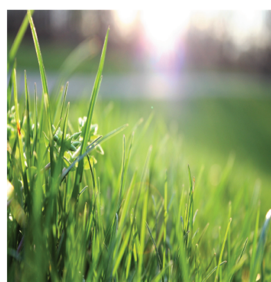
TOT Soccer, Spring Soccer, Coach Pitch, Baseball, T-Ball, Softball, Track & Field, and Swim Team!